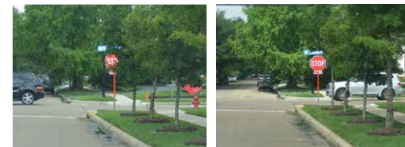
Before and after photos of a stop sign sight visibility obstruction

If there is a regulatory sign (stop, speed, school or park zone, etc.) located in front of your property, please keep in mind that regular trimming is needed to ensure that vegetation does not obscure the sign for the motoring public. A good rule of thumb when deciding if vegetation needs to be trimmed is: if you cannot see the full sign from 3 to 4 property lots away (approx. 150-200 feet), then the vegetation needs to be trimmed. Please see the photographs at the right.