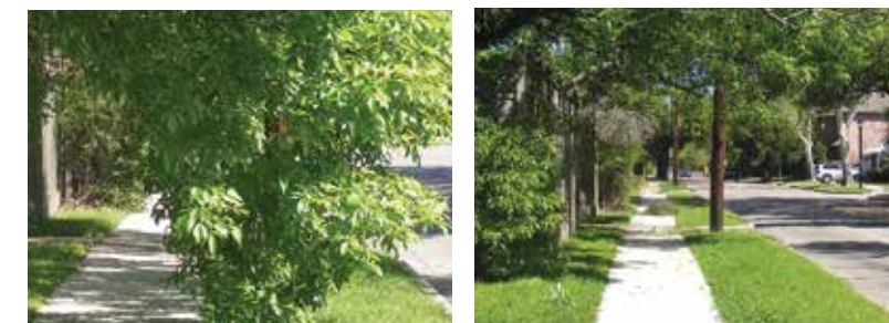
Before and after photos of a sidewalk clearance obstruction

Another issue that needs to be addressed, sometimes more frequently, is the vegetation growing around sidewalks. The City and the Americans with Disabilities Act (ADA) require a clearance height of at least 80 inches over the sidewalk and a minimum of 36 inches of clearance side to side. Please see the photographs at the right.